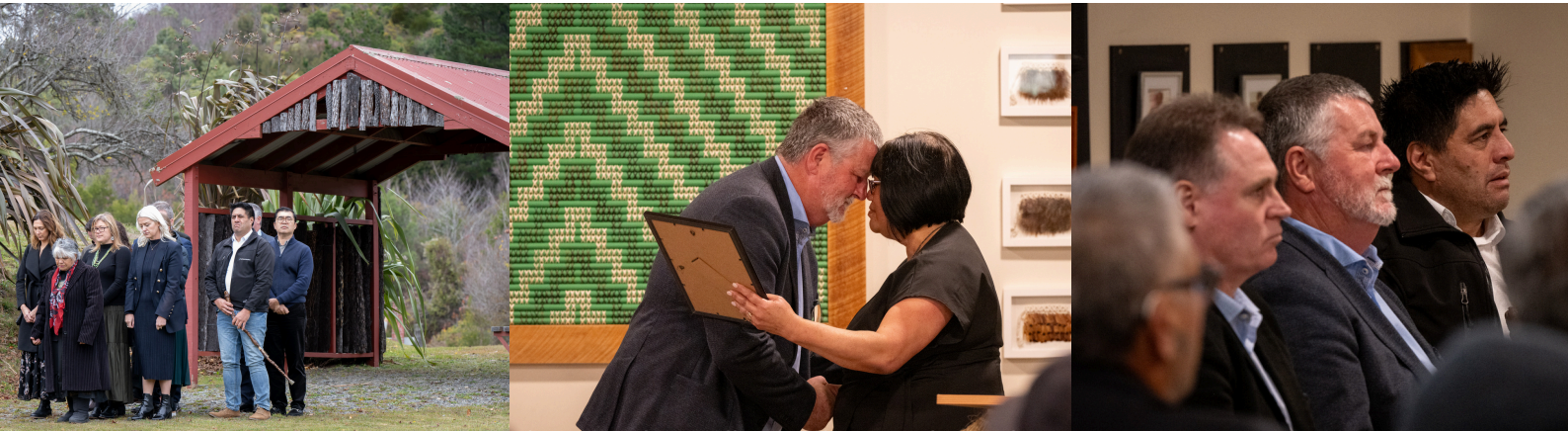
Pānui