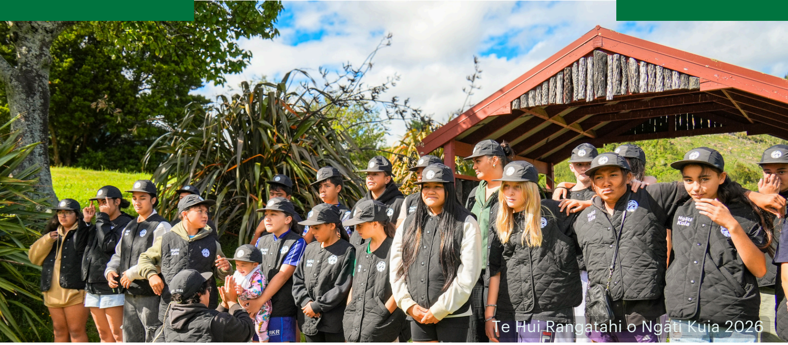
Te Hui Rangatahi o Ngāti Kūia 2026